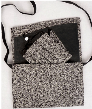
HATCH TAG GLAM BAG