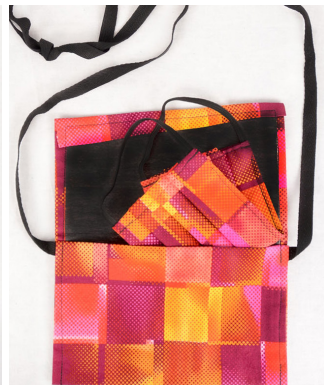
SORBET SOIRÉE GLAM BAG