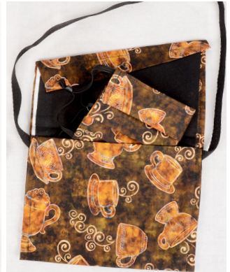
CAFE LATTE GLAM BAG