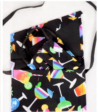
MAKIN' MARGARITAS GLAM BAG