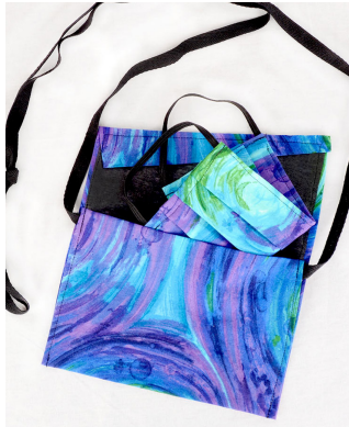
STARRY NIGHT GLAM BAG