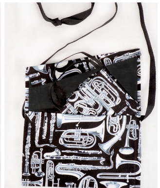
MUSIC MAN GLAM BAG