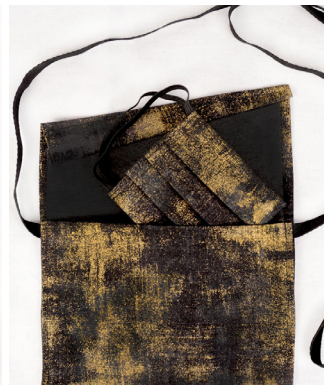
DATE NIGHT GLAM BAG