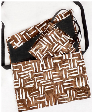
SERENGETI GLAM BAG