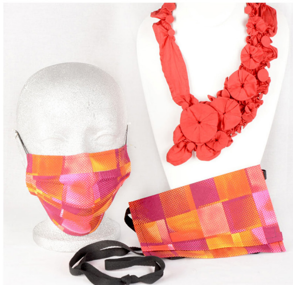
SORBET SOIRÉE COLLECTION