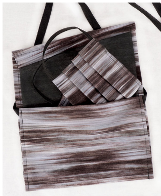
SAND STORM GLAM BAG