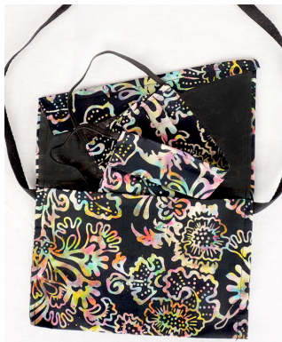
STARRY NIGHT GLAM BAG