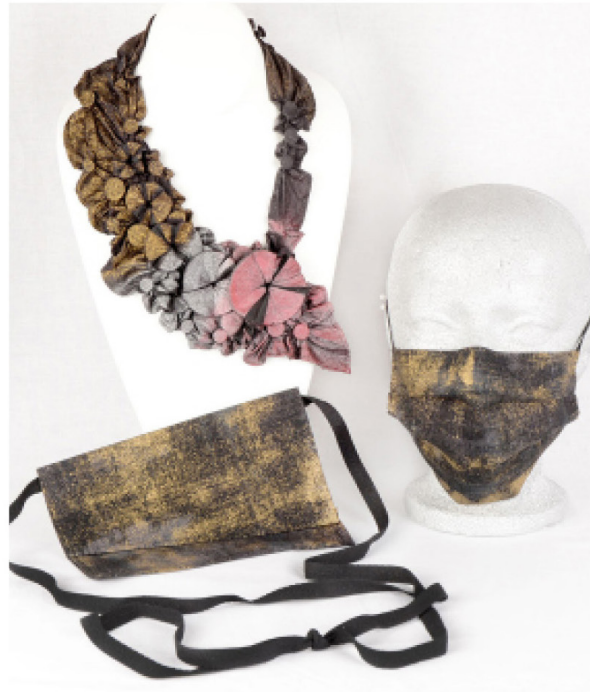
DATE NIGHT COLLECTION