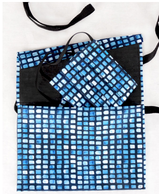
BLUE BLOCKS GLAM BAG