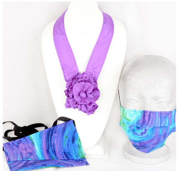
STARRY NIGHT COLLECTION