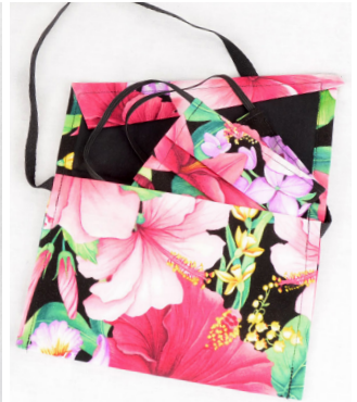
MOTHER'S ORCHID GLAM BAG